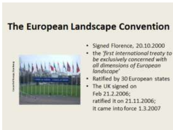
Figure 1: The European Landscape Convention

Many countries in Europe are now at the implementation stage of the ELC, and there are some useful examples of how this is occurring. The ELC was signed and ratified by the UK in 2006 and it came into force in 2007 (Figure 1). In the UK two pieces of research were carried out by Newcastle University in relation to monitoring of ELC implementation; one for Natural England and one for DEFRA both of which aimed to create a baseline of understanding concerning how policy nationally, and in the devolved administrations of the UK, reflected the intent of the ELC. Much of this paper is based on the understandings revealed by that research (Roe, 2013; Roe et al. , 2009; Roe et al. , 2010).