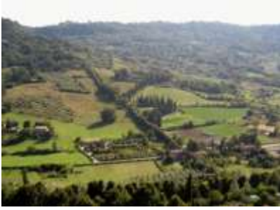
Figure 3: Food production landscapes near Orvieto, Italy: There is increasing interest in the process of landscape creation and identity through the interaction between people and food throughout Europe and in many other countries around the world.

Throughout the cuts and lack of steer from government in relation to strategic landscape thinking in England, there has been some good work continuing on the ground. An example of this is the Durham Heritage Coast Partnership. The management structure of the Heritage Coast Partnership is a modification of the successful multi-agency Turning the Tide on the Durham Coast Partnership. The Turning the Tide project started the process of both restoring the natural processes in the landscape of this coastal area, and involving the community, which had turned its back on the degraded landscape affected by coal spoil. The Durham Heritage Coast Partnership carries out a number of activities to support community involvement. One of these is an annual forum which provides an opportunity for a wide range of local and community interests to input into the management of the area. Small specialist working groups are also sometimes formed to assist with or provide guidance upon specific projects and initiatives. This helps to extend the number of individuals and interest groups which become actively involved in the management of the coast.