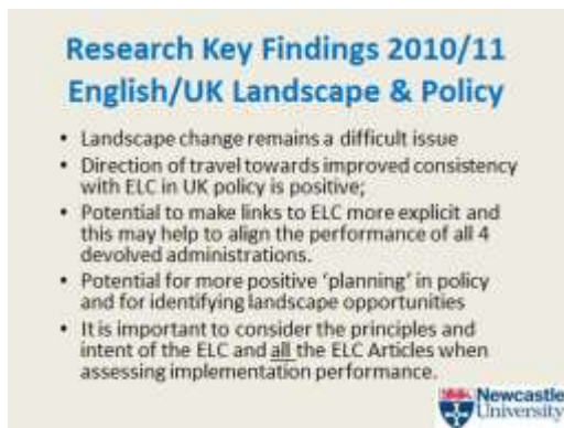
Figure 2: ELC Research Key Findings 2010-11

landscape and they should reflect community attitudes to the landscape. If we regard the ELC as now providing us with the baseline that encapsulates our overall attitude to landscape which then affects our use and management of it, then monitoring policy change in every Member State in relation to the ELC is important as is measuring landscape change. Connecting policy change with change on the ground is desirable but very difficult in the case of the ELC because of the large number of variables involved. What is possible is to identify indicators that provide a picture of change in policy and change on the ground independently and compare these against a baseline condition.