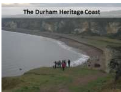
Figure 4: The Durham Heritage Coast at Noses Point: the beach here has been cleaned by both human action and continuing natural processes to remove the coal spoil that made it infamous.

Throughout the cuts and lack of steer from government in relation to strategic landscape thinking in England, there has been some good work continuing on the ground. An example of this is the Durham Heritage Coast Partnership. The management structure of the Heritage Coast Partnership is a modification of the successful multi-agency Turning the Tide on the Durham Coast Partnership. The Turning the Tide project started the process of both restoring the natural processes in the landscape of this coastal area, and involving the community, which had turned its back on the degraded landscape affected by coal spoil. The Durham Heritage Coast Partnership carries out a number of activities to support community involvement. One of these is an annual forum which provides an opportunity for a wide range of local and community interests to input into the management of the area. Small specialist working groups are also sometimes formed to assist with or provide guidance upon specific projects and initiatives. This helps to extend the number of individuals and interest groups which become actively involved in the management of the coast.